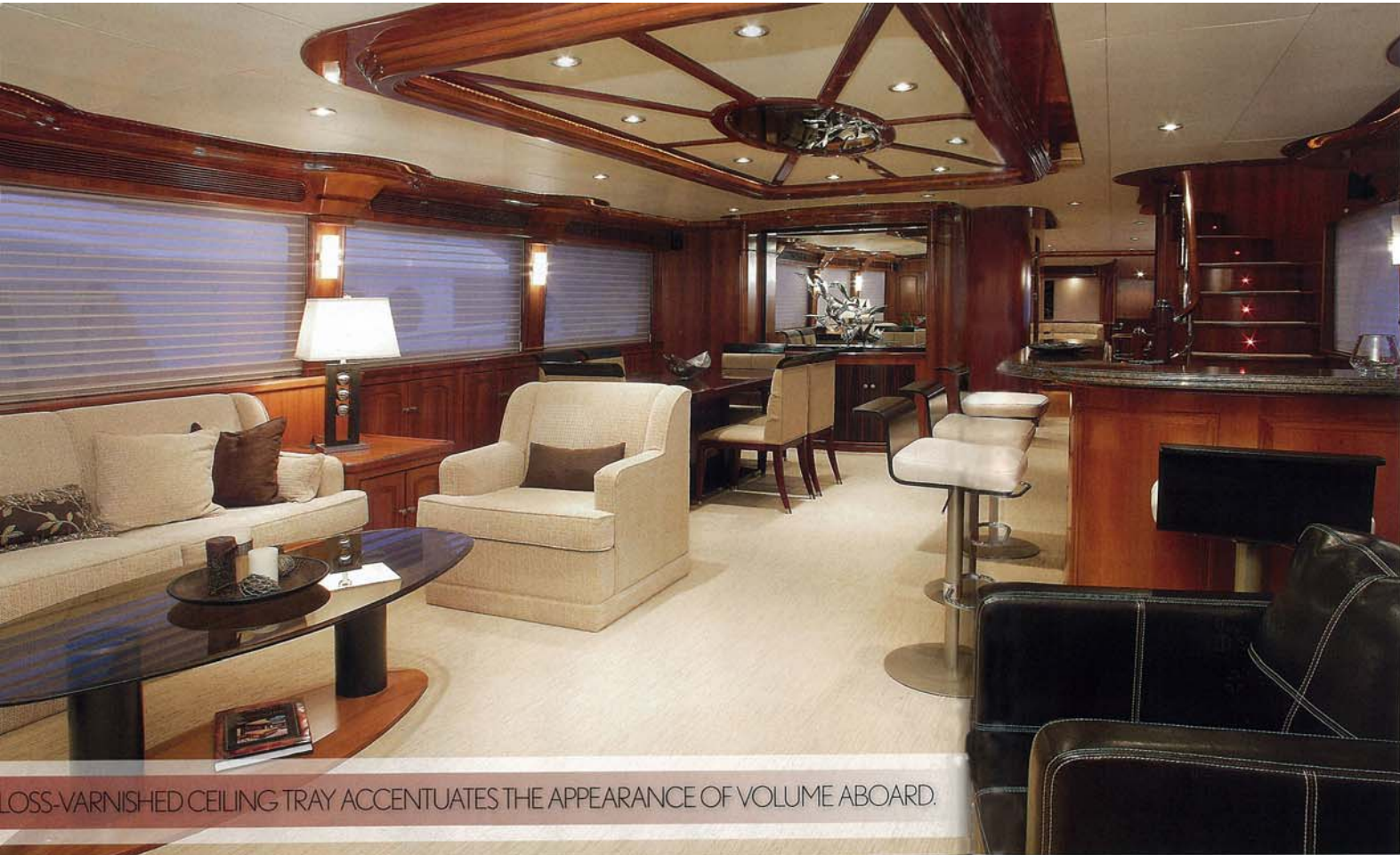
GLOSS-VARNISHED CEILING TRAY ACCENTUATES THE APPEARANCE OF VOLUME ABOARD.